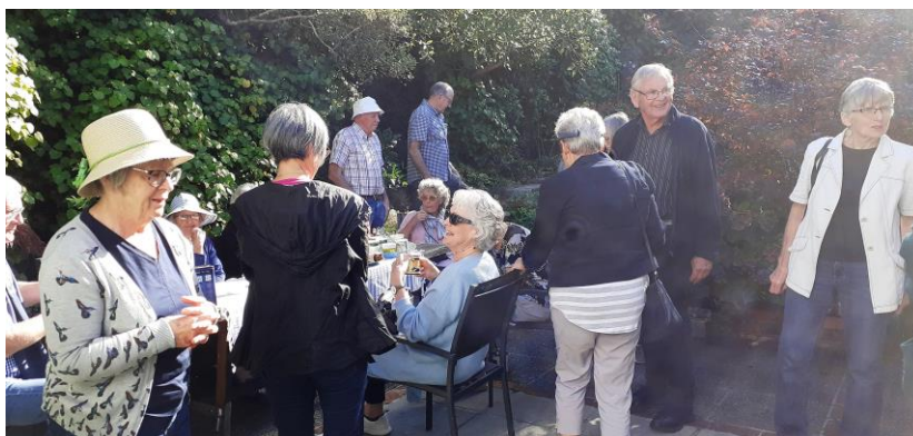
Garden Club members enjoying the autumn sunshine at their April meeting.